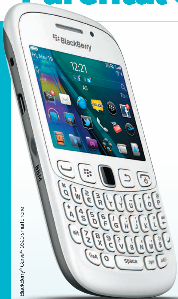
BlackBerry® Curve™ 9320 smartphone

Parental Controls are designed to help you have more control over how the features of the BlackBerry® smartphone are used.